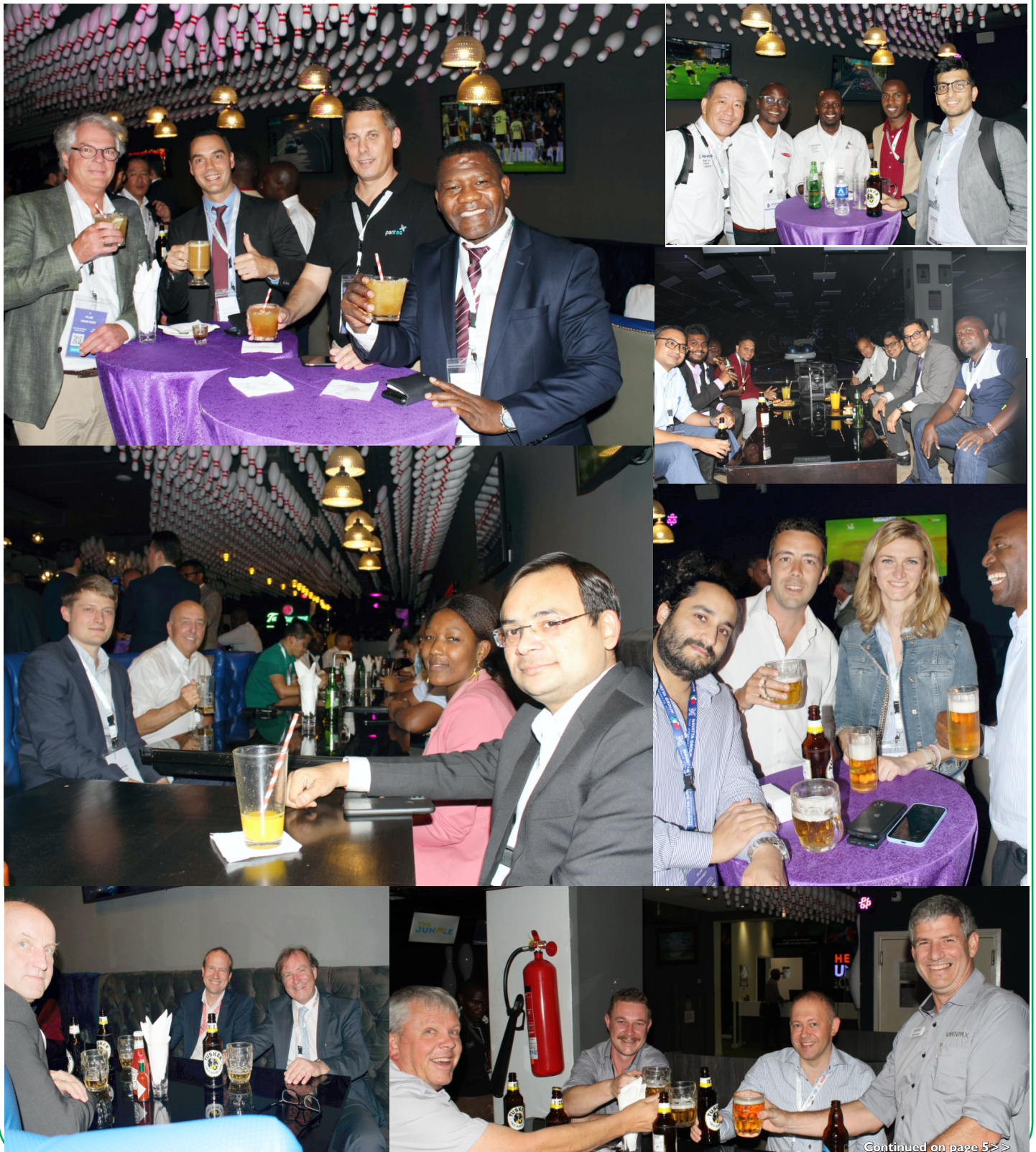
Continued on page 5 >>