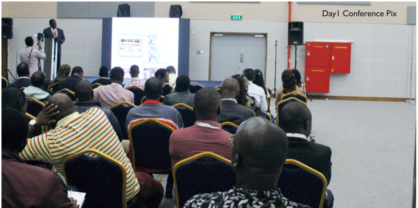
Day I Conference Pix

Collocating with two brand-new shows - Print East Africa and Pro-Agro , this year's PROPAK East Africa 2022 is packed with exclusive but free-to-attend Conference Sessions led by carefully selected industry experts who will share important insights on a broad range of topics during the three-day show.