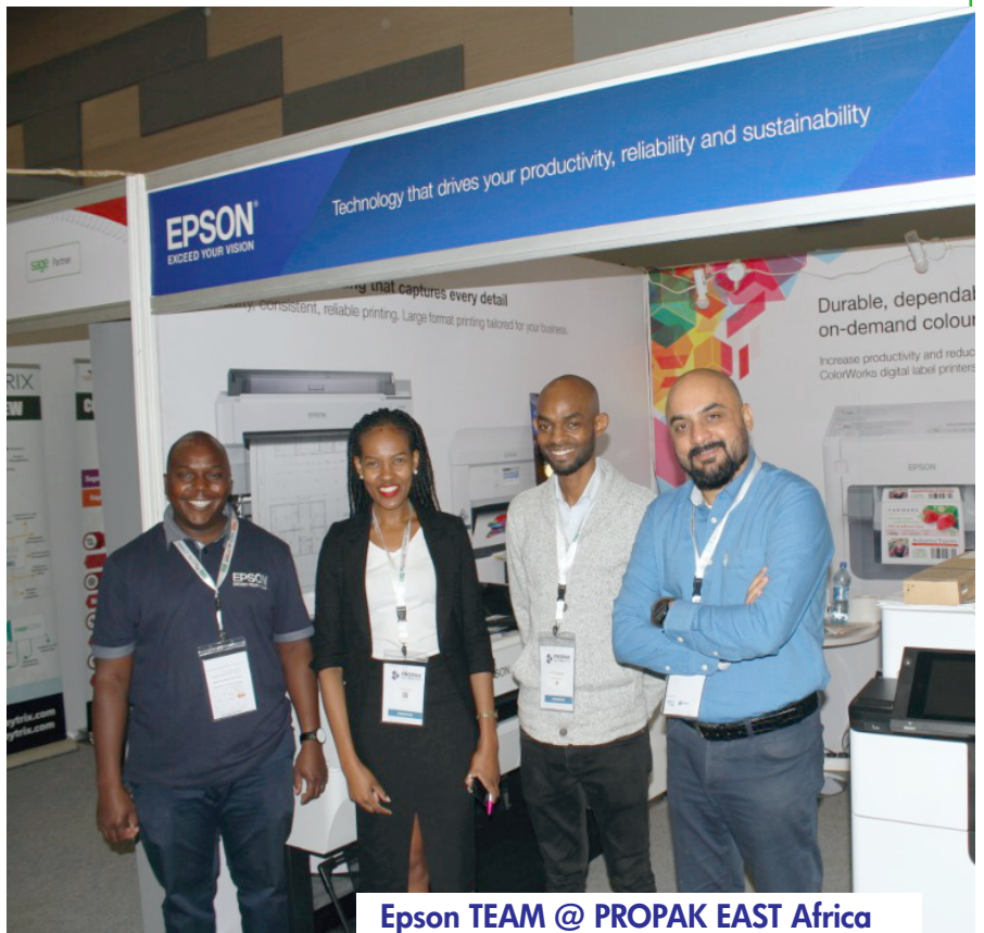
Epson TEAM @ PROPAK EAST Africa