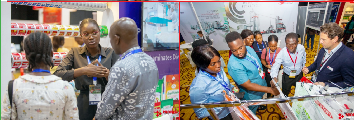
The BIGGEST packaging, processing, printing and plastics exhibition and conference in AFRICA.