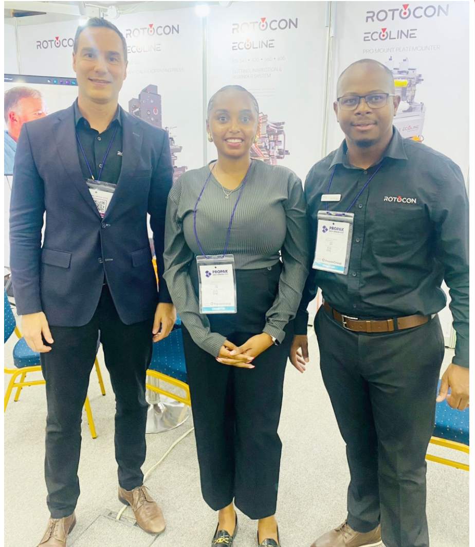
© ROTOCON Team @ PROPAK East Africa 2025