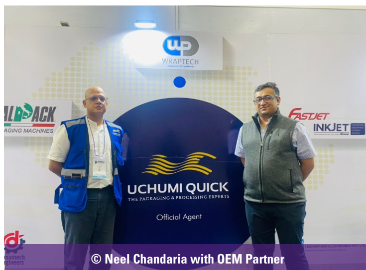
with OEM Partner