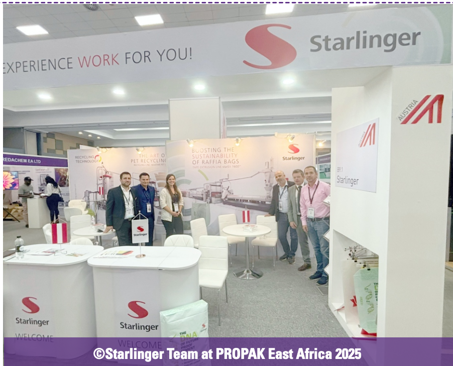
©Starlinger Team at PROPAK East Africa 2025

'Starlinger' is always very enthusiastic and energetic to be at PROPAK East Africa . Meeting lots of current and potential customers. It is always a good exhibition for the company' says Starlinger & Co GmbH Team at the ongoing PROPAK East Africa 2025.