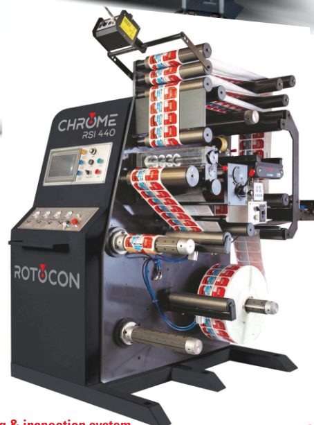
© RSI 440 | 560 slitting, rewinding & inspection system