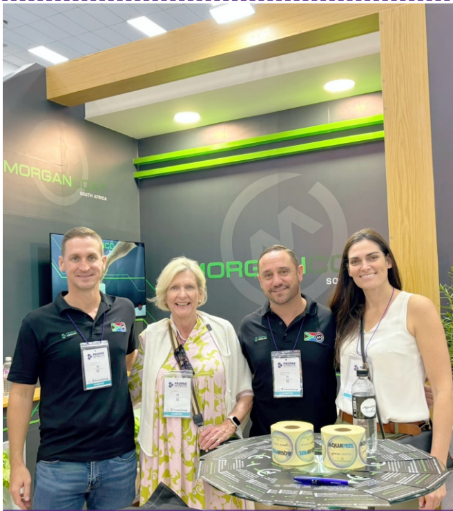
©Morgancoat and PROPAK East Africa DAILY/ PPM - Susi and Samantha

As the East African market continues its upward trajectory in food, beverage, pharmaceutical and cosmetics production, the demand for innovative and sustainable labelling solutions has never been greater.