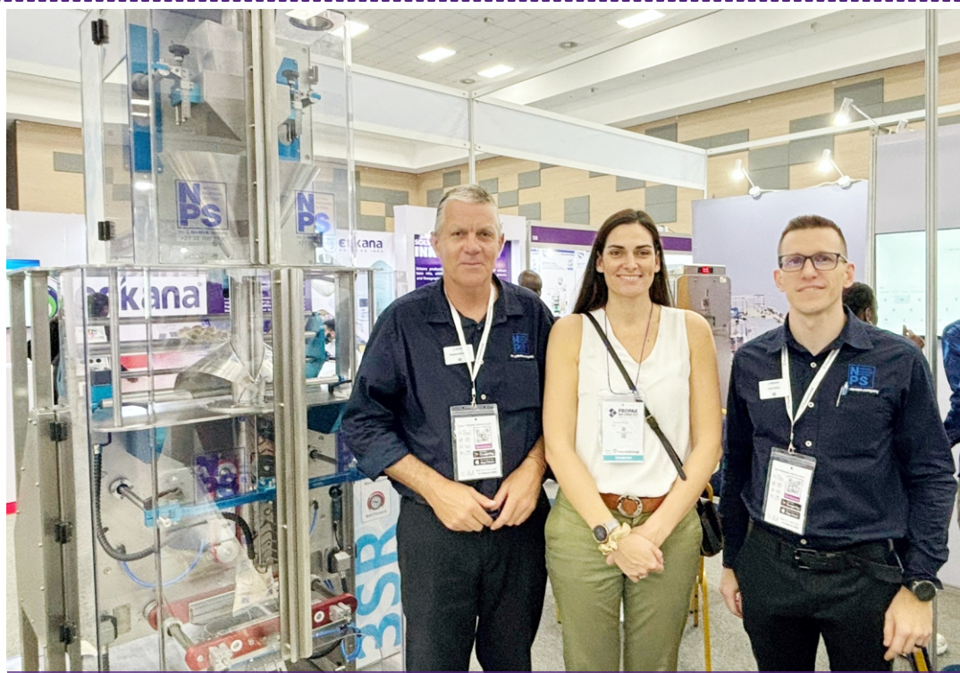
©ISHIDA & National Packaging Systems (NPS) Team with PROPAK East Africa DAILY/ PPM - Samantha

ISHIDA is set to showcase its latest packaging innovations, reinforcing its commitment to efficiency, automation and sustainability. Partnering with National Packaging Systems (NPS) , Ishida will highlight advanced multihead weighers, bagging machines, checkweighers and quality control systems – tailored for key sectors like pulses, grains and snacks.