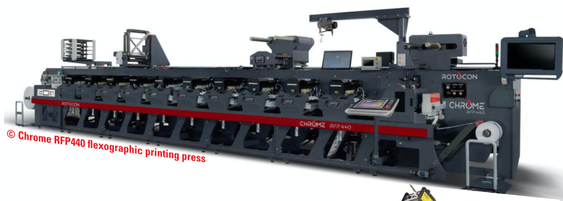
© Chrome RFP440 flexographic printing press