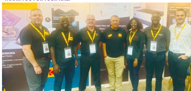
© FC Group Team at PROPAK East Africa 2025