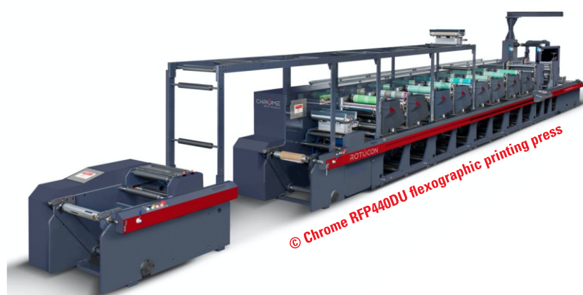
© Chrome RFP440DU flexographic printing press